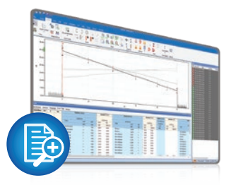
Analyzing multiple measurement files