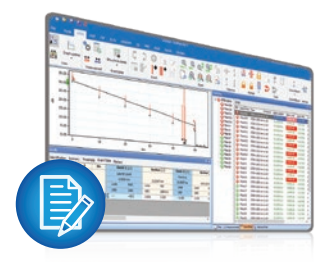
Editing multiple measurement files