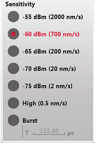
Figure 1. Sweep speed

The burst sensitivity is adapted to burst signals and dedicated to GPON measurements. The duty cycle must be in the range 2-100% with a period between 124 and 2001 µs.